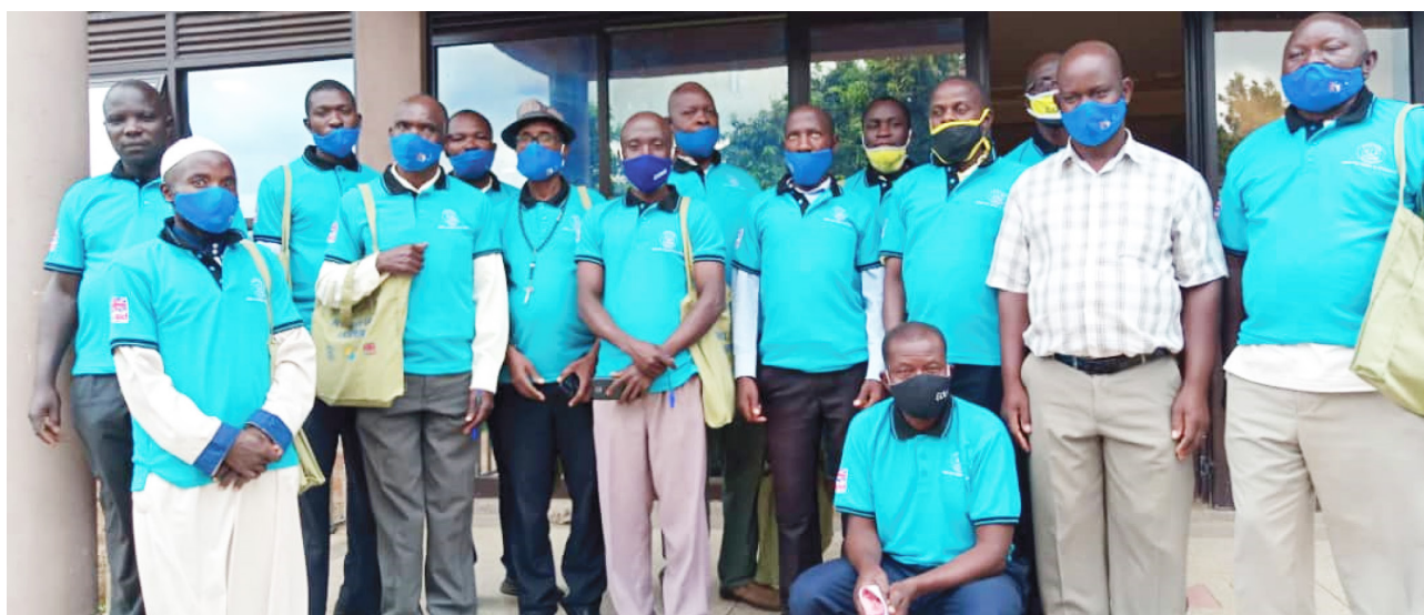
Group photo of the male champions with the trainer-CDI programme Coordinator after the training