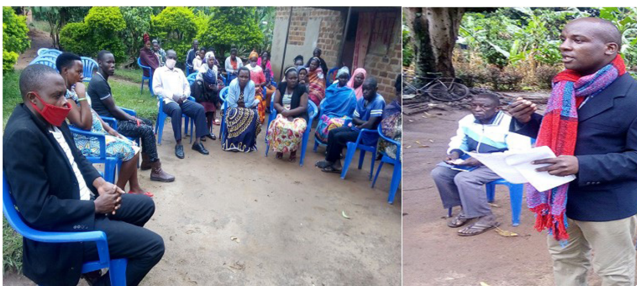
CDI staff during a community awareness meeting on prevention of violence against children

time of the day, most children fall victims to violence mainly at night or evening hours. VAC offenders included parents, close relatives and teachers. Key to note was that parents came up the common offenders of physical and social violence. The identified causes of VAC included; poor parenting skills, ignorance of other alternative means of disciplining children, poverty, cultural norms and practices and general community moral degeneration including gender violence, drug and alcohol abuse. These findings therefore as mentioned earlier led to designing of a 2-year project to prevent violence against children in Luwero district. During the year 2020, CDI carried out sensitization of parents and care givers in positive parenting practises as a strategy for responding to the current violence against children.