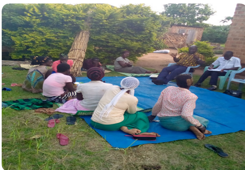
CDI staff during one of the VSLA monitoring meetings in Luwero T/C