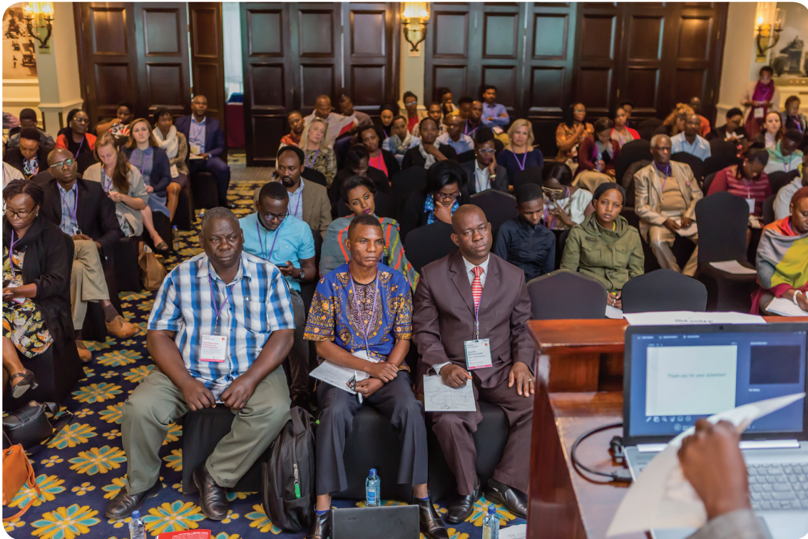
Some of participants during the conference at Stanly Sarova Hotel, Nairobi