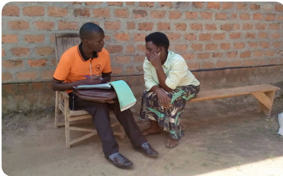
CDI staff during a home visit

into the OVC enrollment form, the OVC comprehensive service registers, and the quarterly OVC MIS reports compiled and shared with the key sub county and district officers. These can well be viewed on the OVC MIS Ministry of Gender, Labor and Social Development website.