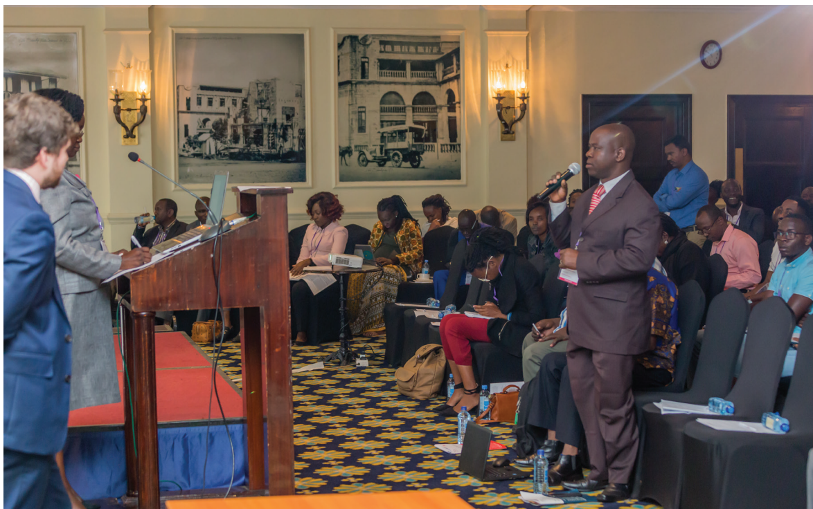
CDI Program Coordinator (standing) making a submission at the conference