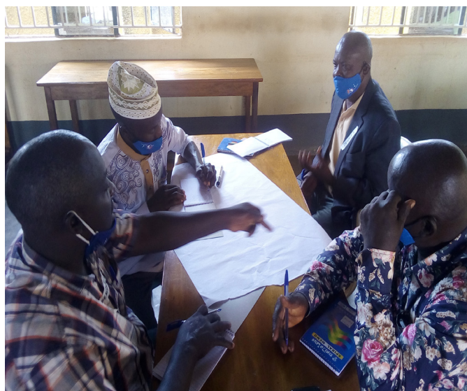
From Left one of the male champions making a presentation during their training and on the Right, some of the male champions during their group discussions on how they can support women programmes in their communities.