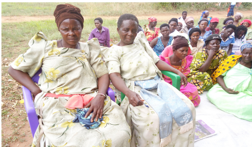
Women of Nambeere Parish- Kamira S/C during a leadership dialogue in February 2020

“Without empowerment for women and girls, there can be no real progress.” Phumzile Mlambo-Ngcuka, Executive Director, UN Women, (11 October 2016).